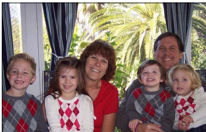
The National Society of Agents for Consumer Education (NSACE) board of directors recently enjoyed the Christmas holiday at grandma and grandpa's house.

Is it just me, or are the years flying by faster and faster? I could swear it was just the other day that we were all in a dither over the Y2K "disaster" looming on the horizon. And now, a decade has come and gone, the world didn't end as the doomsday crowd predicted, and life continues to be wonderful in spite of the economic hardships so many around us are experiencing. I believe that we are richly blessed. If we're up against hard times it's always good to remember the old Jewish proverb; "I felt sorry for myself because I had no shoes -- until I met a man who had no feet." Even when things are bad, they could always be worse!