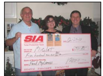
Grand Prize #4 - $501 Charity Miqlat Melawi Orphans

A HUGE Thank You!! You helped raise over $10,753.00 in donations to your favorite charities and our communities!